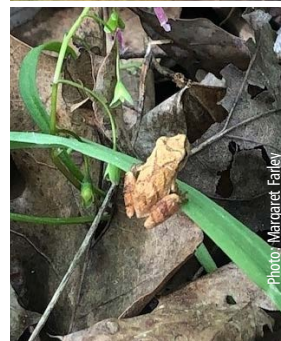
above: Northern Leopard Frog ( Lithobates pipiens ) right: Spring Peeper ( Pseudacris crucifer )