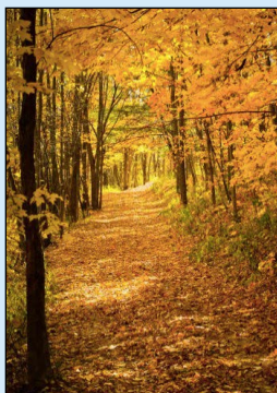
2nd Place: Angela Copper, "Blackhawk Trails Golden Way"