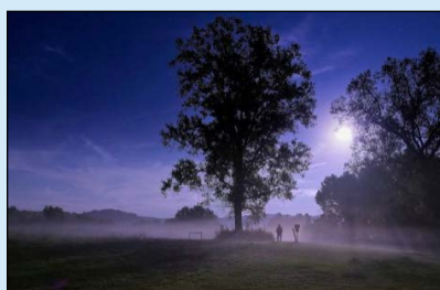
3rd Place (tie): Dan Van Vuren, "Blackhawk Ridge Trail"