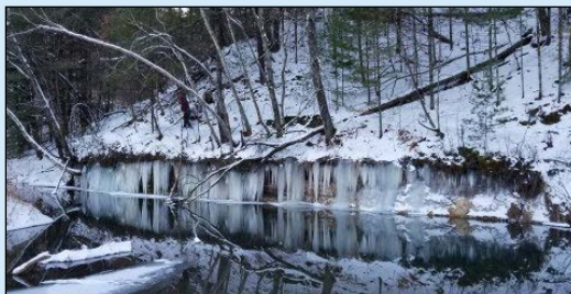
1st Place: Emily Oium, "Reflections on Weister Creek"

Entries for the 2023 Photo Contest can be submitted to the Friends website Sept. 1-Oct. 13.