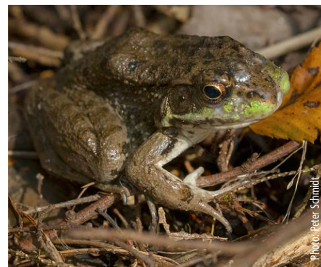
Green Frog ( Lithobates clamitans )

Cut-Off Trail begins with a shrubby wetland, a few wet cliffs, and upland forest (if we get that far). There are two creek crossings, so some wet to mesic species. Anticipated plants include: skunk cabbage, marsh marigold, purple fringed orchid, mosses, polypody and other ferns, eastern hemlock, paper birch, speckled alder, Japanese hedge parsley, columbine, harebell, heliborne orchid, reed canary grass, oak, maples, swamp saxifrage, white pine, and a bunch of others I will not tell... “secret plants” only for those who